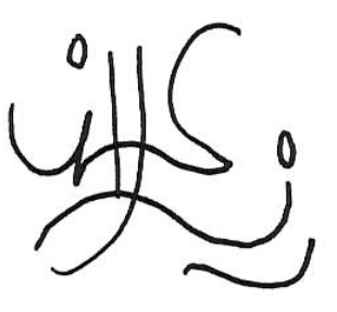
Nôrah Monaii (the name of this Sign)